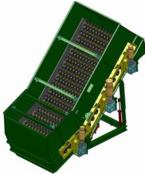
MEDIUM POLISHER 84in